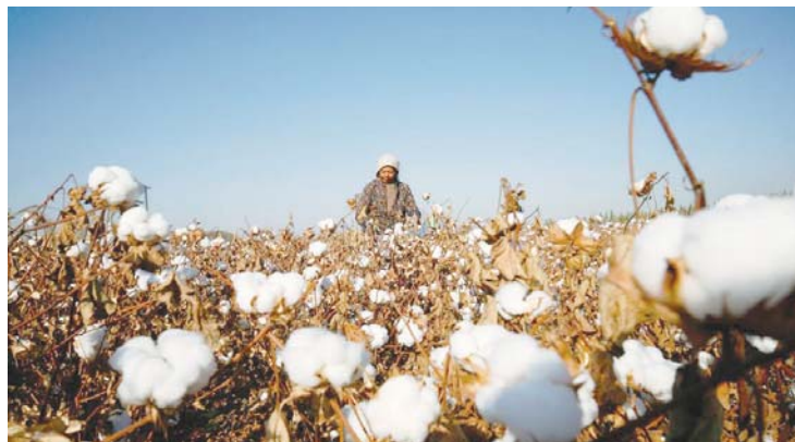
XINJIANG: A farmer picks cotton on a farm on the outskirts of Hami, Xinjiang Uighur Autonomous Region, in China on Nov. 3, 2010.